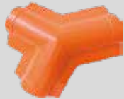
Three way Ridge