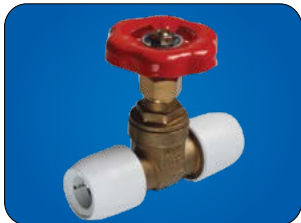
Gate Valve - Hot / Cold