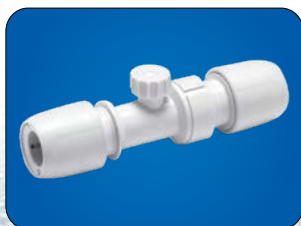
Double - Check Valve