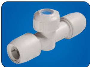
Shut- off Valve